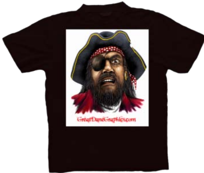
JPEG with background