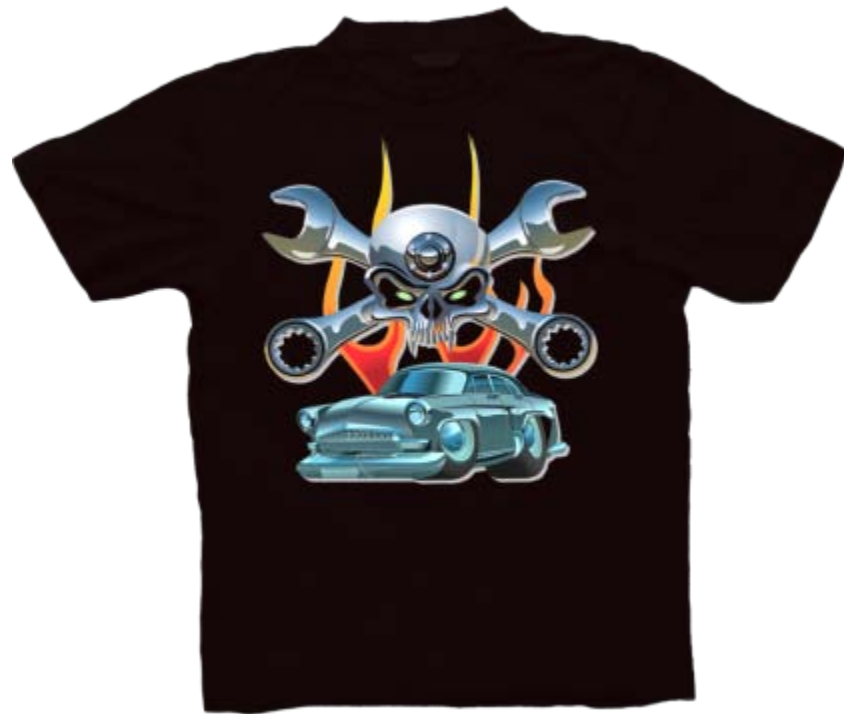
The T-shirt is now creating the black in our image