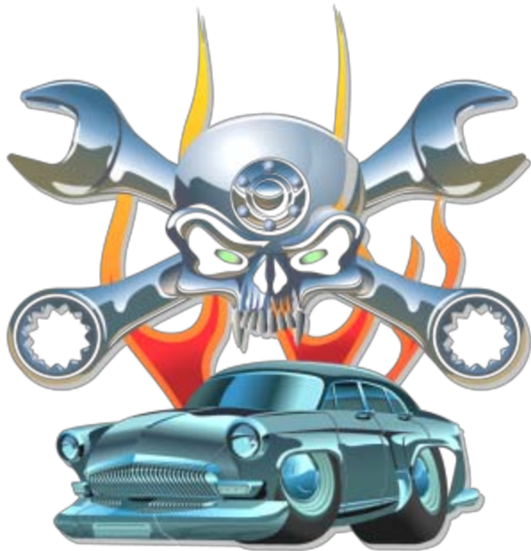
Black removed from areas of graphic