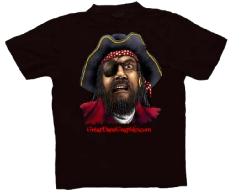
Background removed and saved as transparency